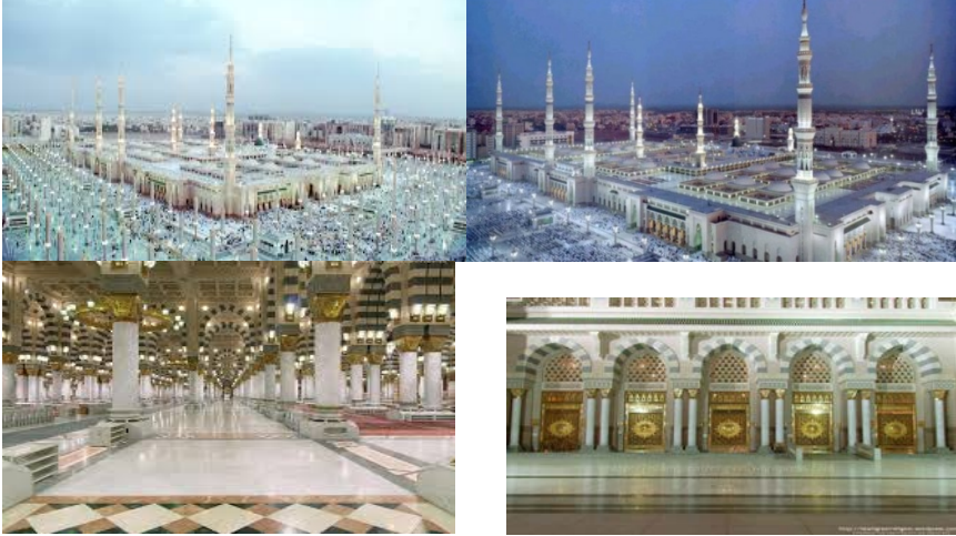
Old pictures of Masjid-e-Nabwi